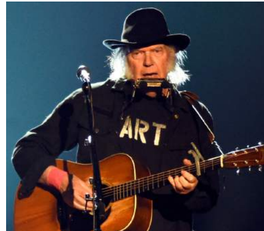
Grammy Award-winning musician Neil Young.