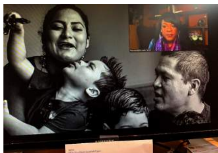
Rep. Herod reading Women of Resolution via Zoom, 2020.

After the global pandemic paused all in-person performances, Motus Theater was one of the first arts-based organizations in Colorado to pivot to virtual performances. Margaret Hunt, the ED of Colorado Creative Industries, even used Motus as an example of arts leadership during the pandemic. Motus' 2020 programs reached over 222,824 people due to the vast reach of our virtual events and the success of our Shoobox Stories podcast.