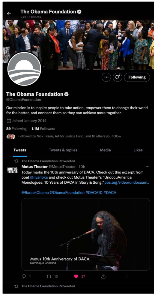
Obama Foundation pins Motus' UndocuAmerica: 10 Years of DACA performance to its Twitter page

Motus' programming in honor of the 10th anniversary of DACA included an award-winning public art collaboration with muralist Edica Pacha. Each of the 12 murals in the Denver Metro area included a QR code to the English and Spanish video of a Motus UndocuAmerica monologist reading their own story. See the murals and hear the monologues at <a href="https://www.motustheater.org/murals-eng">www.motustheater.org/murals-eng</a>.