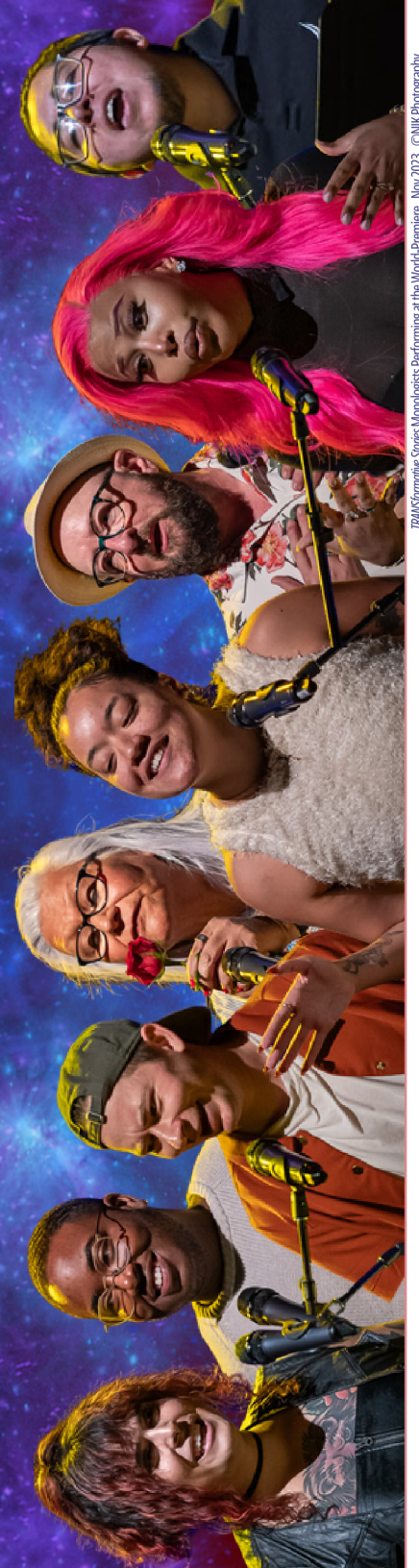
7MM/Symantic-Stories Monologues Performing at the World-Premiere, Nov. 2023.