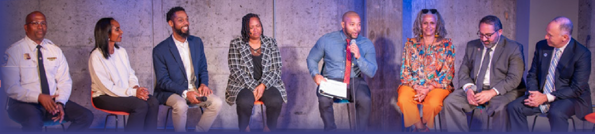
Talkback after a JustUs performance with the Office of the Attorney General of D.C., Brian L. Schwab. The performance for 100 prosecutors was aimed to support a more humane juvenile justice system. JustUs Monologues were co-read by four leaders responsible for different areas of the juvenile justice system.