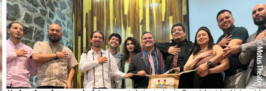
UndocuAmerica monologists present their stories in Spanish at La Universidad de Chapingo during the Aztec New Year celebrations.